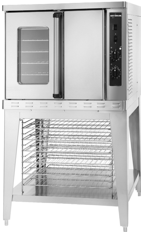
ASC-4G With optional stationary oven stand and pan rack with shelves - 5003489