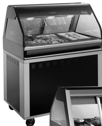
EU2SYS-48 FRONT VIEW SHOWN WITH OPTIONAL CASTERS