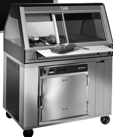
EU2SYS-48 Back view shown with 750-TH-II Cook & Hold oven and optional casters