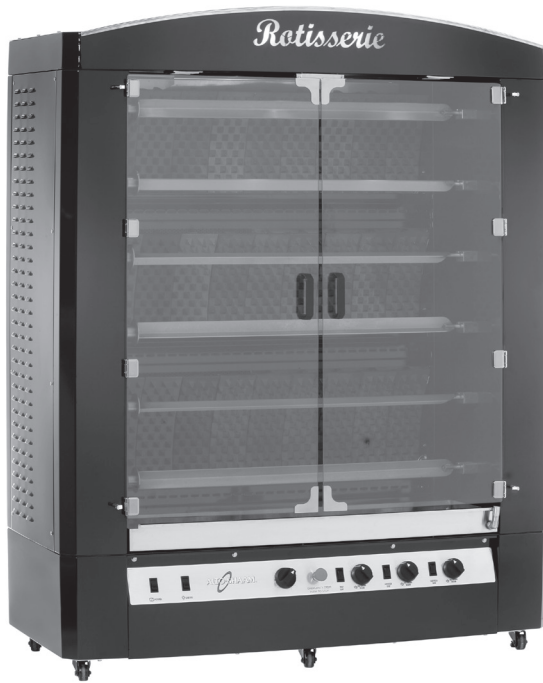
Shown with optional black exterior