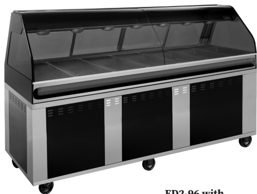
ED2-96 with BU2 Short Base Front view shown with optional casters

The display case is constructed of 18 gauge, non-magnetic stainless steel. A curved, tempered glass front encloses the display case and can be lifted to a 90 degree angle for easy cleaning. Removable, sliding glass doors on the operator side are included. Sliding door tracks have a "clean sweep" cutout allowing for easy cleaning and crumb removal. Framed end clear glass with rubber gasket material protects glass edges from chipping and breakage. The base is divided into three (3) individually managed heat zones with each zone controlled by a separate thermostat with a range of 1 through 10 and heat-on indicator light. Overhead lights are controlled by On/Off switches in three (3) light zones. Two (2) 125V plug outlets are available as an option on 120/208-240V units only. Decorator base includes one set of leveling bolts.